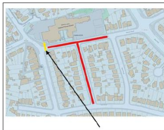
A map of the School Street location can be seen marked in red on the map. It is the section of Malvern Road outside of the school and the whole of Beatty Road. Barriers will be placed at each end of the closed roads. The barrier location marked on the map with an arrow is where permitted vehicles may enter and exit.

The big news this week is the launch of our School Street on Monday, 10 th November – there has been lots of work going on in the background to prepare for this, and I am very grateful for the support of BCP council, the school staff, and the parents who have shown their support for this initiative. So, from Monday morning, the area shown on the map below will be closed to traffic from 8.15 – 8.45, and 2.30 to 3.10. We believe that this is going to make the area in front of school much safer for our children to walk, cycle or scoot and we really hope that as many of you as possible will be doing that. Please be aware that residents of Beatty Rd and Malvern Rd will still be able to move their cars, and that we will be letting emergency vehicles through, so children would still need to be vigilant. We really appreciate your patience and support with this initiative!